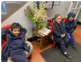
Reception children waiting patiently to board the school bus.

Stops (depending on day): Wesley Ave, Mile End, Leyton Stn, Branch Rd, Salway Rd, Liddington Rd, Royal Wharf, Bank St - Canary Wharf